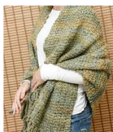
If you are really keen...