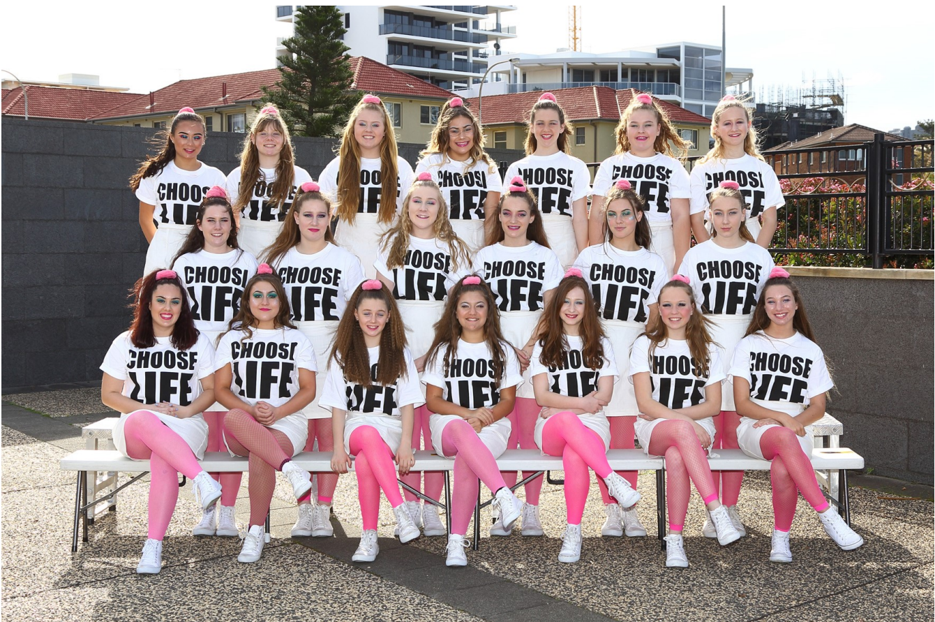
Photos for sale. See Page 11 for details.