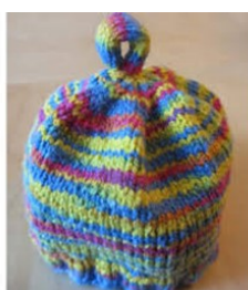
After a month....